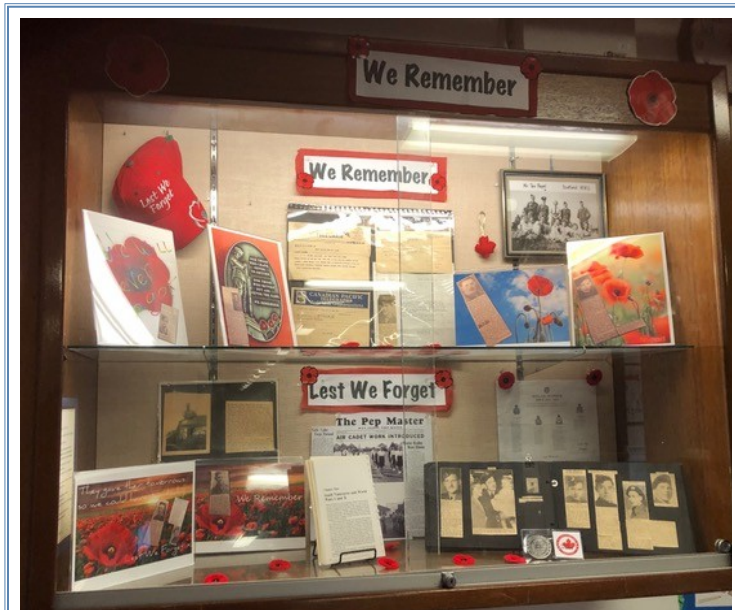
John Oliver Remembrance Day Display